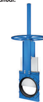
Handwheel with rising stem